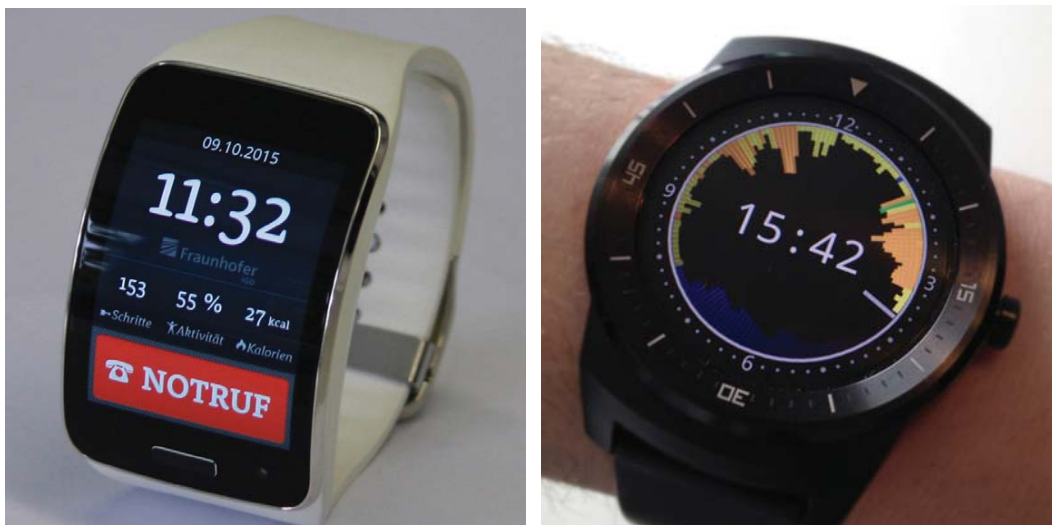
Fig. 1. Prototype of the DHC system implemented on a Samsung Gear S Smartwatch (left) and Activity watchface implemented on an Android Wear LG G Round (right)

In this paper we present a concept and a prototypical implementation of a smart health support system that is based on customary smartwatches, which we call the Digital Health Companion (DHC) . We combine activity, vital data, and anomaly recognition technologies with default functions of current smartwatches, such as location tracking, push messaging, or phone calls, to allow for the usage of a stigma-free automatic emergency assistant. We thus contribute improved activity recognition algorithms that can be implemented energy efficiently and user independently on customary smartwatches, while keeping the desired complexity and recognition accuracy. Furthermore, we address an important issue - permanent vital data extraction with smartwatches - that can be exploited as a feature and that allows for the detection of health risks. Moreover, we try to find new ways regarding interaction and usability with small screens that can be controlled by old and/or handicapped people. The DHC not only offers a smart health support to consumers, but also a solution for house emergency services and other aid organizations in order to efficiently support customers. Our prototypical implementation runs on customary smartwatch models ( see in Fig. 1 ).