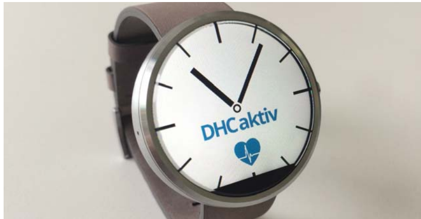
Fig. 3. Motorola Moto 360 smartwatch with DHC watchface

While the benefits of the DHC system as a whole are not limited to medical support or emergency services that supervise handicapped people, we also envision ways to directly commercialize it in the consumer market. In regard to this, we imagine DHC to have the potential to be used for several purposes such as: