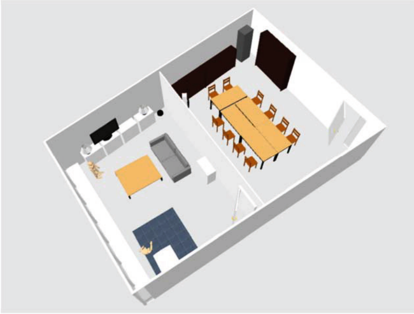
Fig. 1 - Smart Home / Smart Office laboratory

The Smart Home section includes devices like a smart fridge, a smart couch, a smart couch table, a smart mirror and a smart TV. Fig. 1 shows the Smart Home laboratory and some of its devices. The Smart Office section includes devices like a Microsoft Surface Hub coffee table, a projector, a smart coffee machine and various environment-sensors, measuring things as e.g. the air quality, humidity or the air temperature in the room.