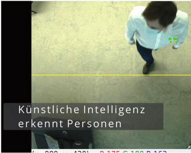
Fig. 2 - Detecting people entering the home using computer vision

voice, iris recognition etc. Currently, the system uses computer vision, based on OpenCV and machine learning to detect people entering the smart home. Cameras are located in less private areas like the entrance focusing only a small area and also only from above. The AI only tries to recognize people coming or leaving and does not record any biometrical information. Data processing is done locally.