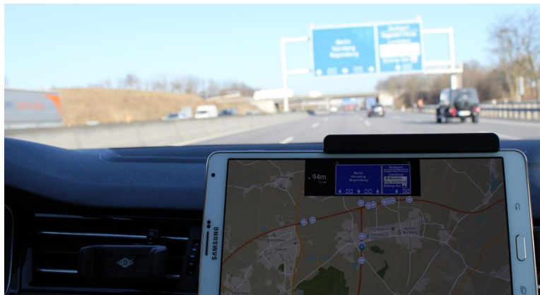
Fig. 3: Test application in vehicle displaying the same VMS as on the road

To prove the feasibility of our approach, to align information in vehicles with those on VMS, we conduct a field test. We analyze data sets recorded by the Road Authorities, the SDBS providers and the test application in the vehicle (see Figure 3). All data are recorded on May 23rd, 2017 along two highway sections in South Germany: (1.) highway A9 close to Nuremberg and (2.) highway A9 and A92 north of Munich.