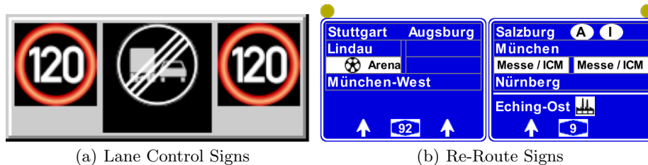
Fig. 1: Variable Message Signs (VMS) on a German highway

its three sides (cf. Figure 1(b)). Most often, several prisms need to be turned for one route change, to keep re-route information aligned. This may take several seconds due to the mechanical process of turning.