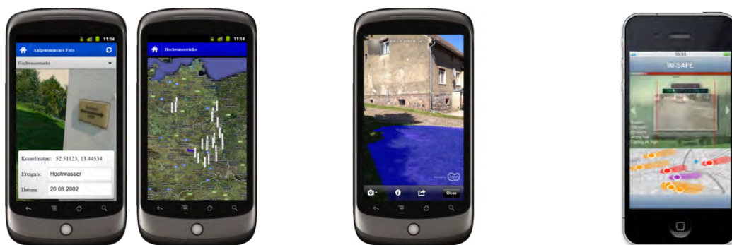
Figure 3. Screens of FloodRiskApp “Hochwasserrisiko” (left & middle) & Warning screen of IM-SAFE (right)

(2) Crowdsourcing for plausibility checks and augmentation: This approach uses crowdsourcing to check the plausibility of prediction model outputs or to augment the overall picture of the hazard situation. In our example a river observer community reports via a similar app (providing geo-referenced, text messages and photos) flooding, dam or other infrastructure damages before and during the disaster to the authority flood warning center. The information is used for the operators to perform a plausibility check on the flood prediction using reported floods and detect possible upcoming threads by the damage reports. An interesting feature of this app is the possibility to compare the water levels of flood prediction with the real water level at the geo-location on the mobile device using augmented reality as shown in Figure 3 (middle). The advantage of this approach to use crowdsourcing in EWS is its flexibility in terms of information types and its reduced quality requirements since the output is either double-checked with an operator and prediction model or just used as an indicator to augment an overall hazard situation picture. However, it still requires either the recruitment and management of a reliable community or appropriate data filtering processes when opened to the public or passively analyzing existing open accessible messages such as Twitter.