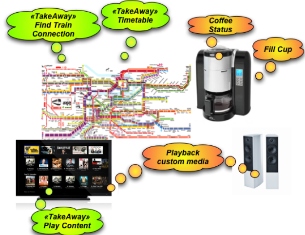
Figure 2. In this example, services with the takeaway-attribute are connected to a metro plan and a TV screens. The coffee-machine and speakers providing playback services but only allow direct interaction.

Applications like Wikitude (cf. [11]) or Layars (cf. [10]) already turn public spaces into a kind of "informational smart environment" by displaying additional information about a location the user is close to.