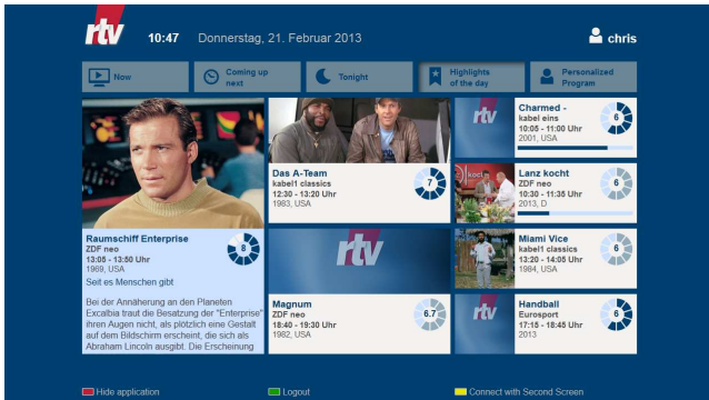
Figure 1: TV Predictor Menu

The TV Predictor Menu will open when users press the red button on their remote control. As shown in figure 1 there is a main navigation on the top of the screen. The part below is used to display the contents of the current section – in this case the program highlights of the current day.