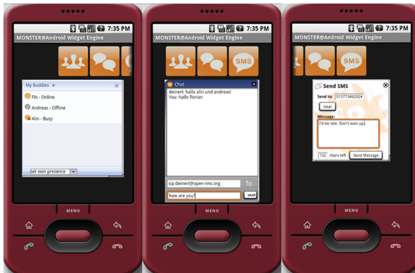
Fig. 4. Widget Engine on Android Emulator

The same widgets deployed on the desktop widget engine will also run on Android. This enables rapid development of Android IMS applications without knowing anything about Java or the Android code model. Only some lines of HTML and JavaScript must be written to create an IMS application on Android.