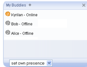
Fig. 3. Address Book / Presence Widget

Each widget may contain an init function, which can be written by the developer. This function is executed after the widget has finished loading. The init function is meant to define what happens when incoming events, like an incoming call for instance, occur. The following code demonstrates the simplicity of the API. In the init function of the example call widget a callback function is defined which is invoked when an incoming call arrives. The callback function starts to play a ring tone and sets the global JavaScript variable status to "Incoming". The lower 4 lines handle the call status inside of JavaScript. onConnectionStatusChange subscribes this widget for notifications of call connection status changes. If the status changes it is displayed above the input field.