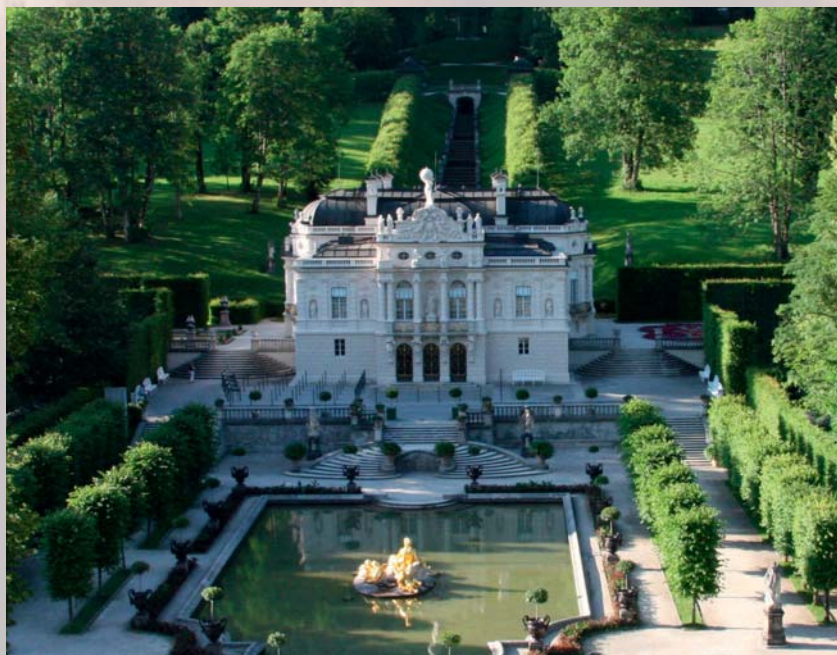
CASTLE OF LINDERHOF OF THE BAVARIAN KING LUDWIG II

cultural assets, such as museums, churches, castles, libraries, and archives, which operate under changing environmental conditions in different climatic zones.