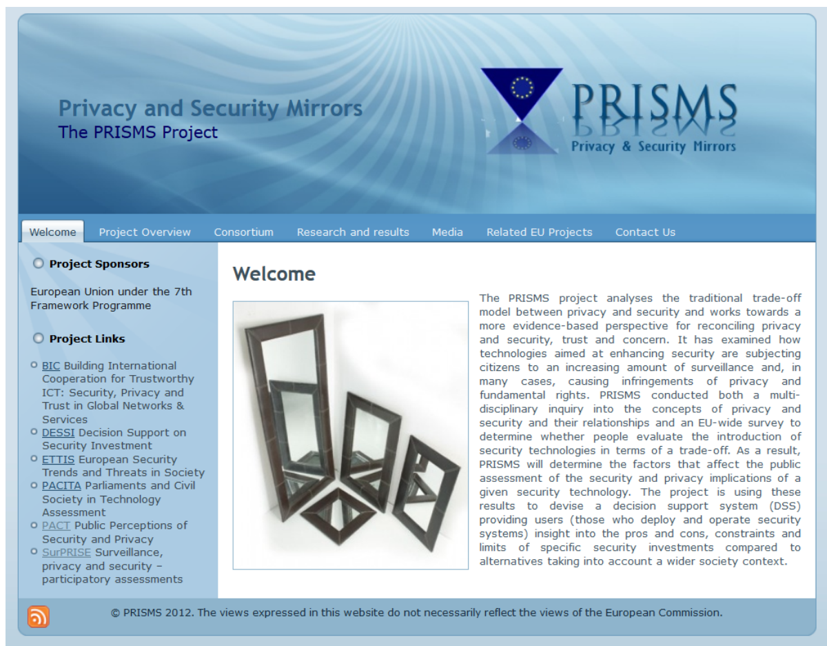
Front page of the PRISMS website

The initial launch of the website was delivered in Month 3 of the project, and included a project-specific logo design. The website was periodically updated through the lifespan of the project, particularly when new public deliverables or publications produced or new events were promoted.