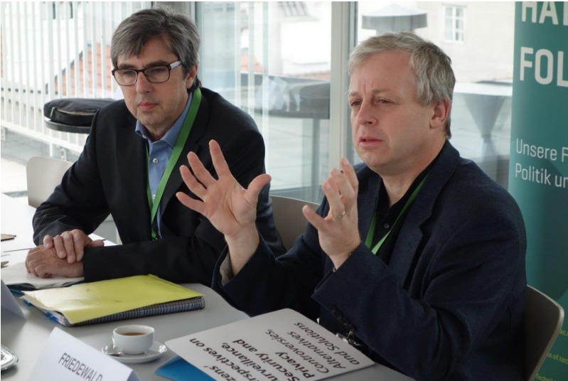
Photos from the Final Conference and Press Conference