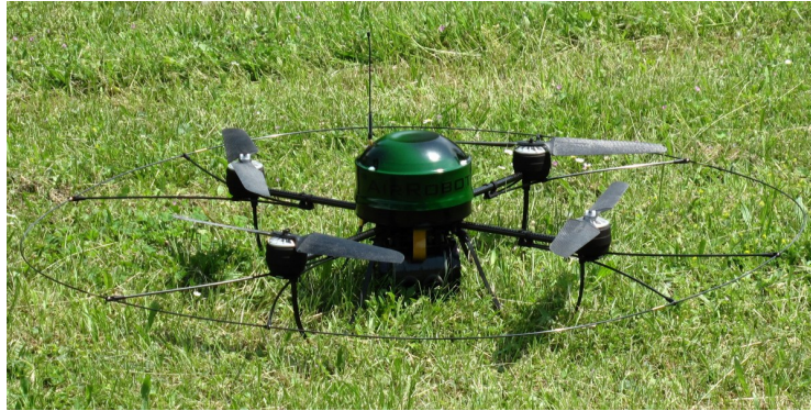
Fig. 1. A quadcopter serves as flight platform

Other essential prerequisites are the possibility to add new sensors and payloads and the ability to interface with the UAV's control system in order to allow autonomous flight. A platform that fulfils these requirements is the quadcopter AR100-B by AirRobot (s. Fig. 1). It can be either controlled from the ground station through a command uplink or by its payload through a serial interface. The latter feature was used to realize autonomous navigation (s. Section 4).