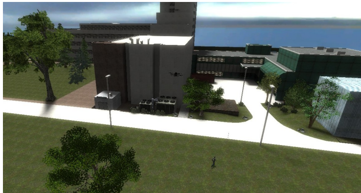
Fig. 4. Simulation of an intrusion scenario

An example scenario that simulates an intrusion has been implemented (s. Fig. 4). Besides the UAVs and the actors in the scenario, also sensors have been modeled. Different kinds of sensors such as motion detectors, cameras, ultrasonic or LIDAR (light detection and ranging) sensors can be modeled with their specific characteristics. The simulation tool can decide if an object lies within the range of a sensor. This helps to evaluate and optimize the use of different sensing techniques.